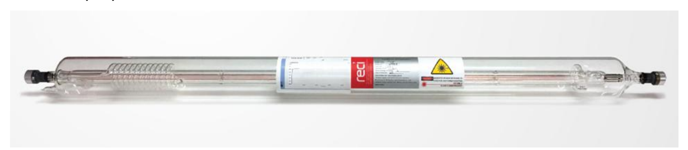
Figure 1 Location of safety symbols